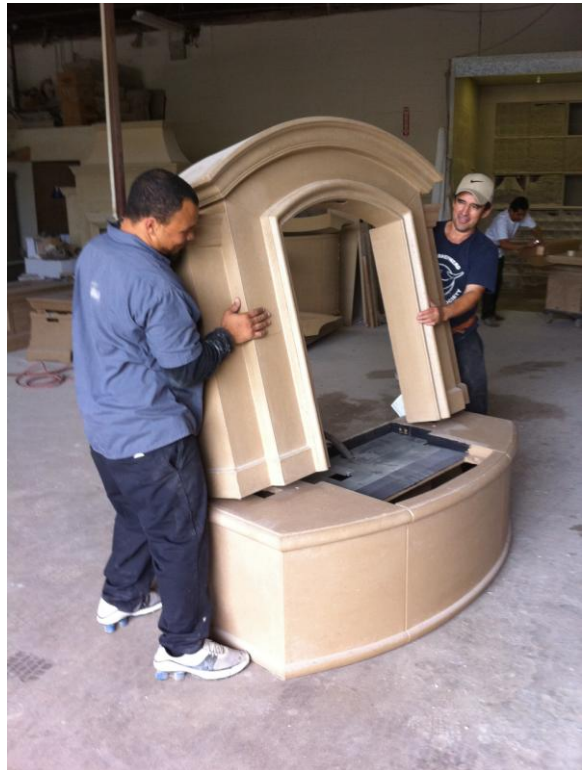
#2. Place body onto hearth and bolt together.