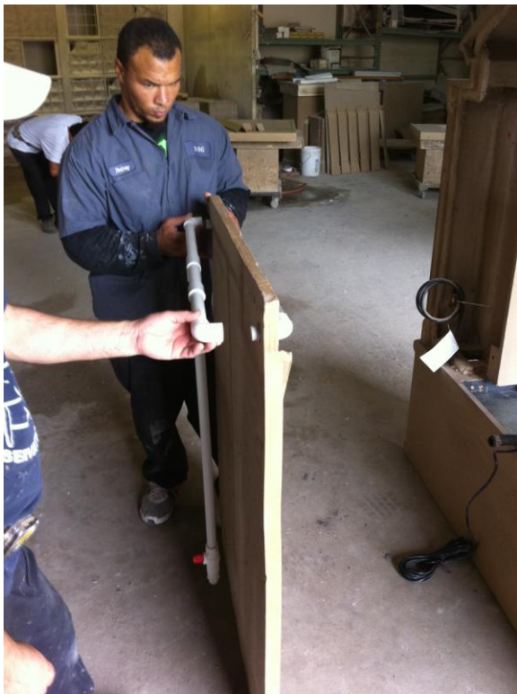
#3. Attaching plumbing.