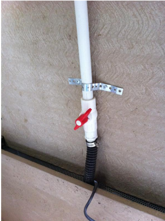
#9. Fill the well with water. Turn unit on and set ball valve to avoid excessive splashing.