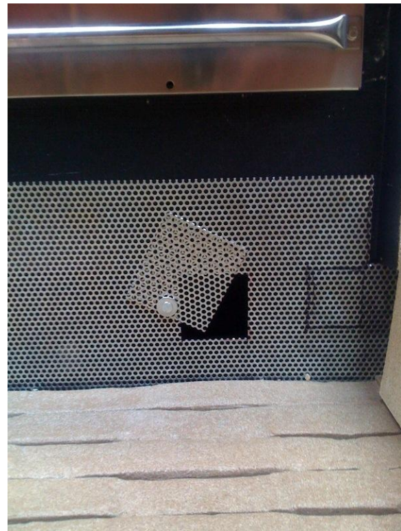
#12. This picture shows access door to tank. TO CHECK WATER LEVEL , move glass aside and slide open door.