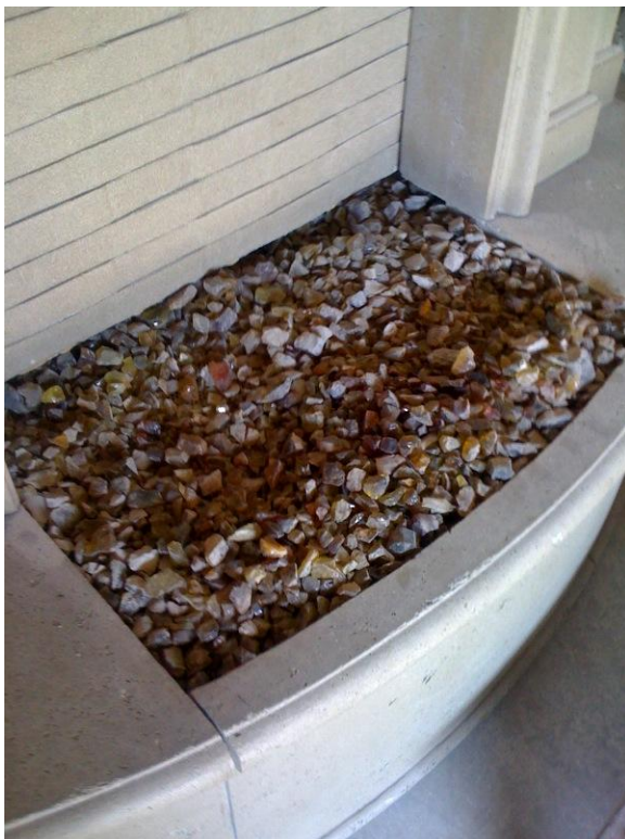
#11. Cover burner and screen with glass, and you are ready to ENJOY!