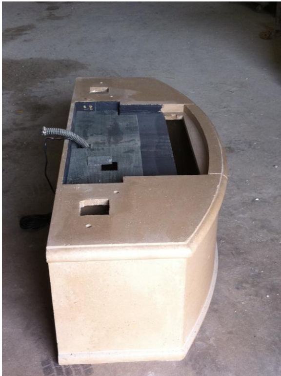
#1. With flex hose attached to pump, place in well and place screen on top of well.