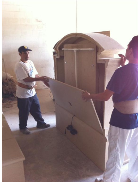
#10. If a back was ordered, attach it now.